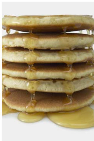
April's meal was one of the favorites : Pancakes!

winds Community Meals team to utilize the streamlined Crosswinds Downtown procedures for collecting, tracking, and spending funds on providing food. The Rossi's implemented these procedures at the last picnic and found it to be